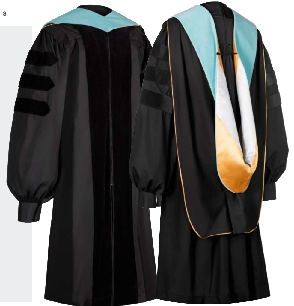
Example shown: Doctor of Education (E.D.)—light blue velvet with gold and white school color satin lining.