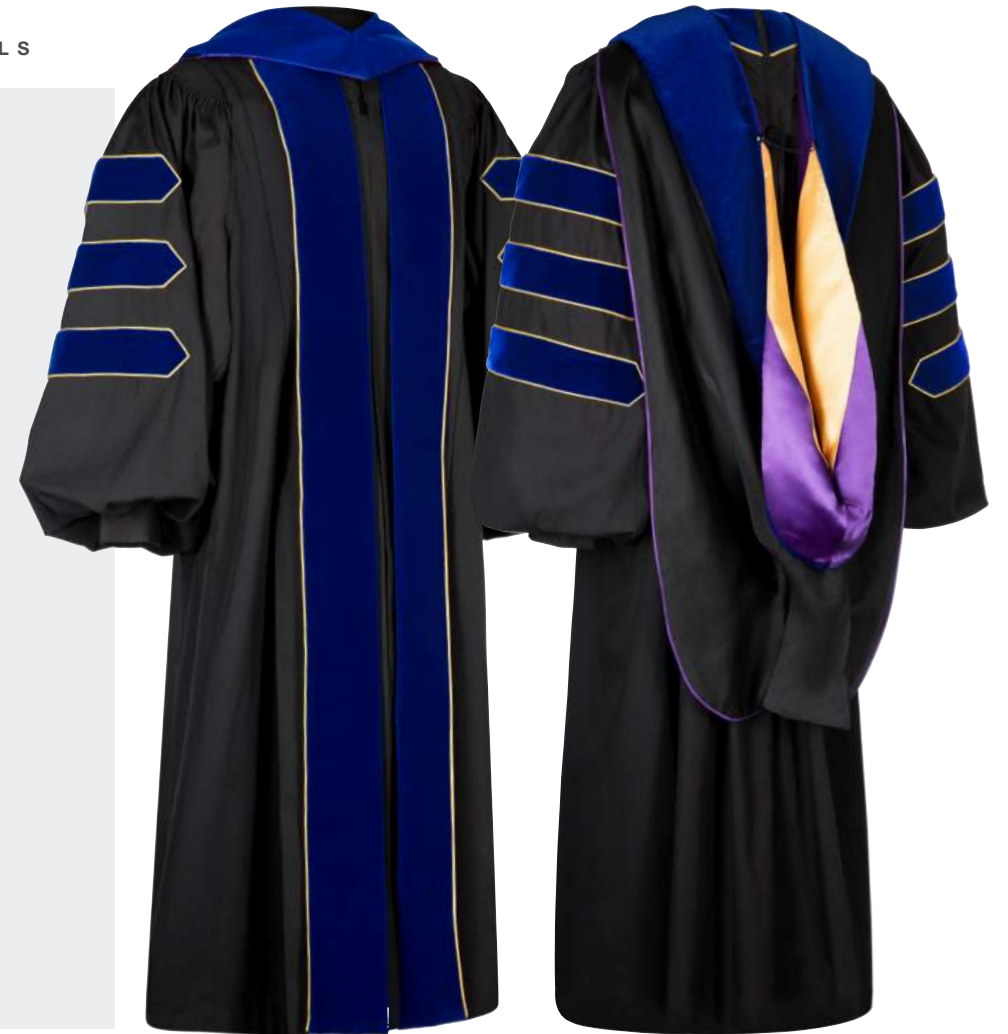
Example shown: Doctor of Philosophy (Ph.D.—royal blue velvet) with purple and gold school color satin lining.

Pockets and access openings on both sides.