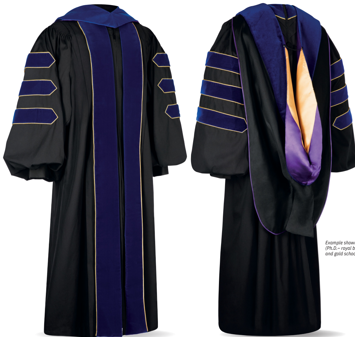
Example shown: Doctor of Philosophy (Ph.D. – royal blue velvet) with purple and gold school color satin lining.